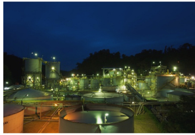
Pongkor Gold Mine