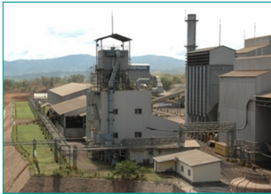
Pabrik FeNi III, Pomalaa