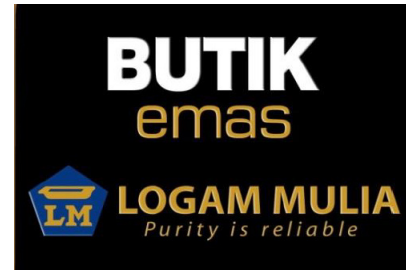
Logam Mulia Gold Boutique