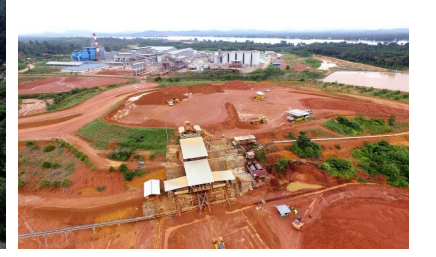
Pomalaa Ferronickel Plant