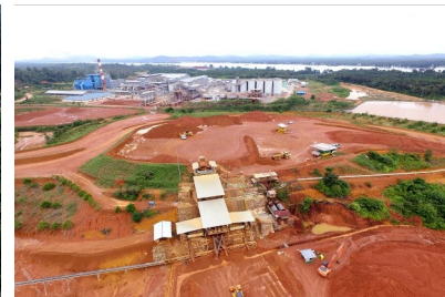
Tayan Bauxite Mine