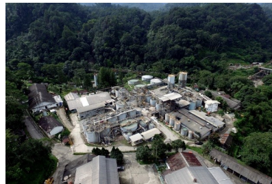
Pongkor Gold Processing Plant