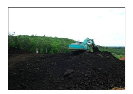
Feronickel III Plant, Pomalaa